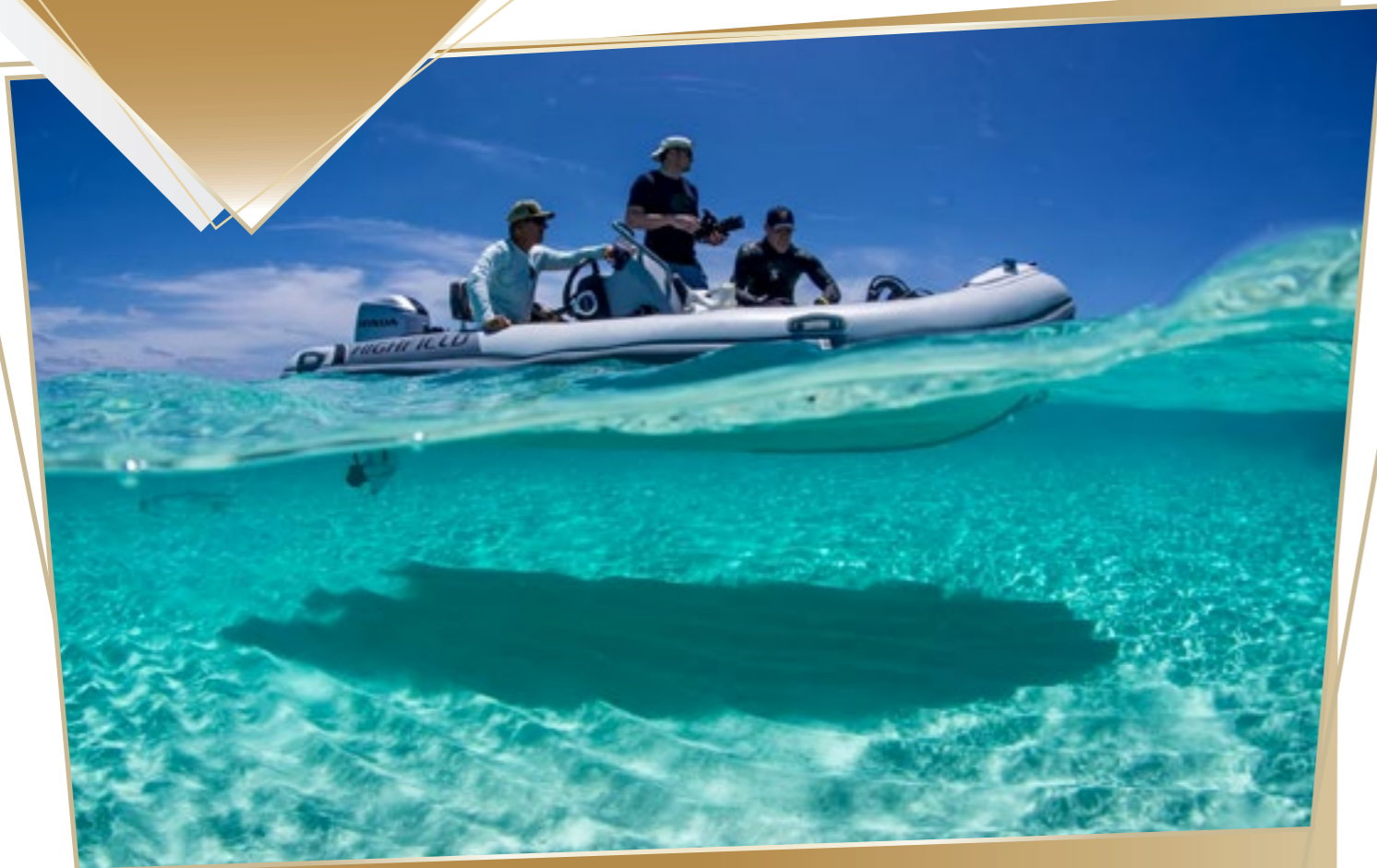
THE BOAT IS EQUIPPED WITH A TENDER HIGHFIELD®