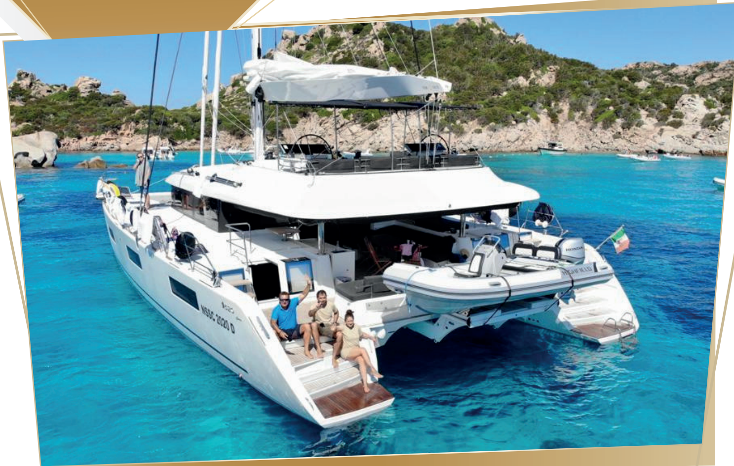
HIGHFIELD® 460 TENDER WITH 40HP OUTBOARD ENGINE ALLOWS YOU TO REACH THE MOST BEAUTIFUL COVES.