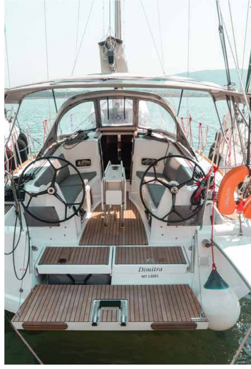
Innovative deck plan that makes sailing easy