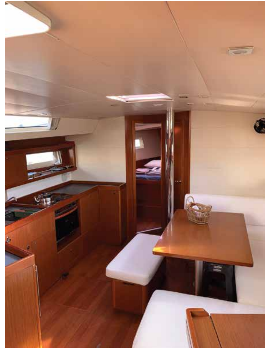
Fully equipped galley with plenty of storage space and brand new counter tops and galley equipment.