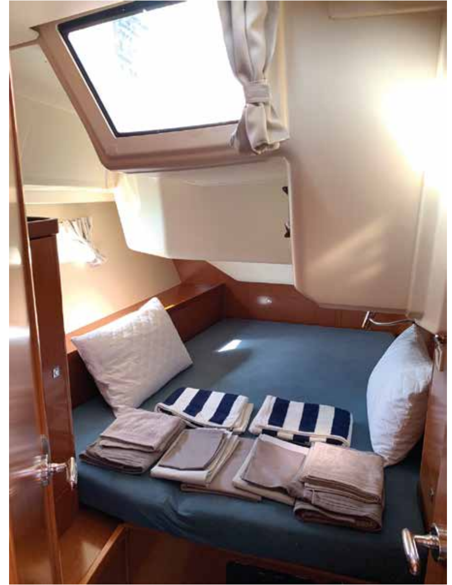
Each cabin has fans, closet space, reading lights and good ventilation