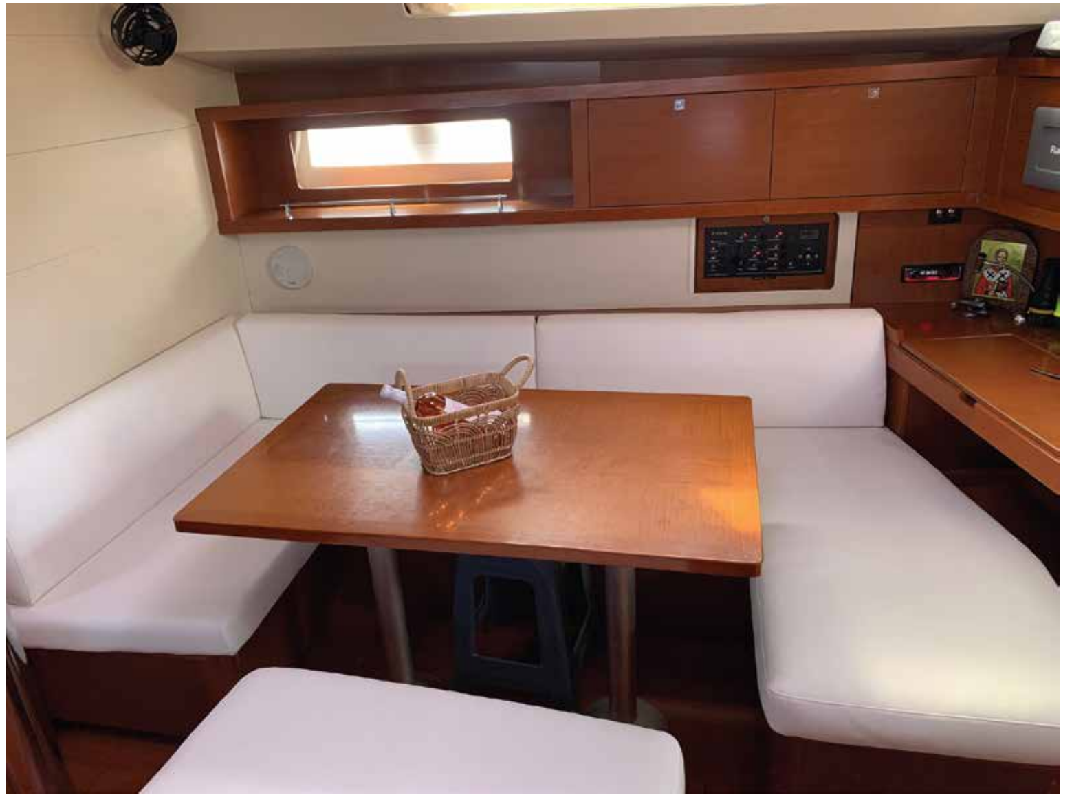
Spacious saloon with convertable dining table to double berth. Fully equipped galley, navigation station, plenty of storage space