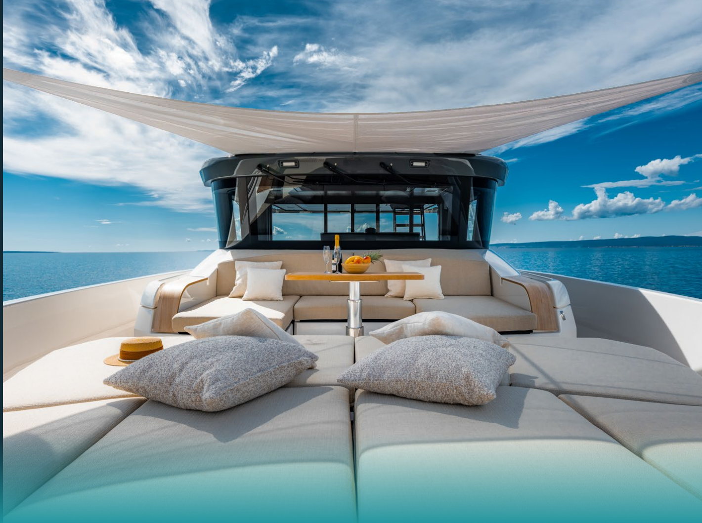
Sundeck bow view