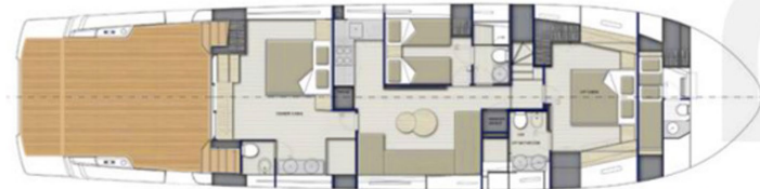
LOWER DECK B