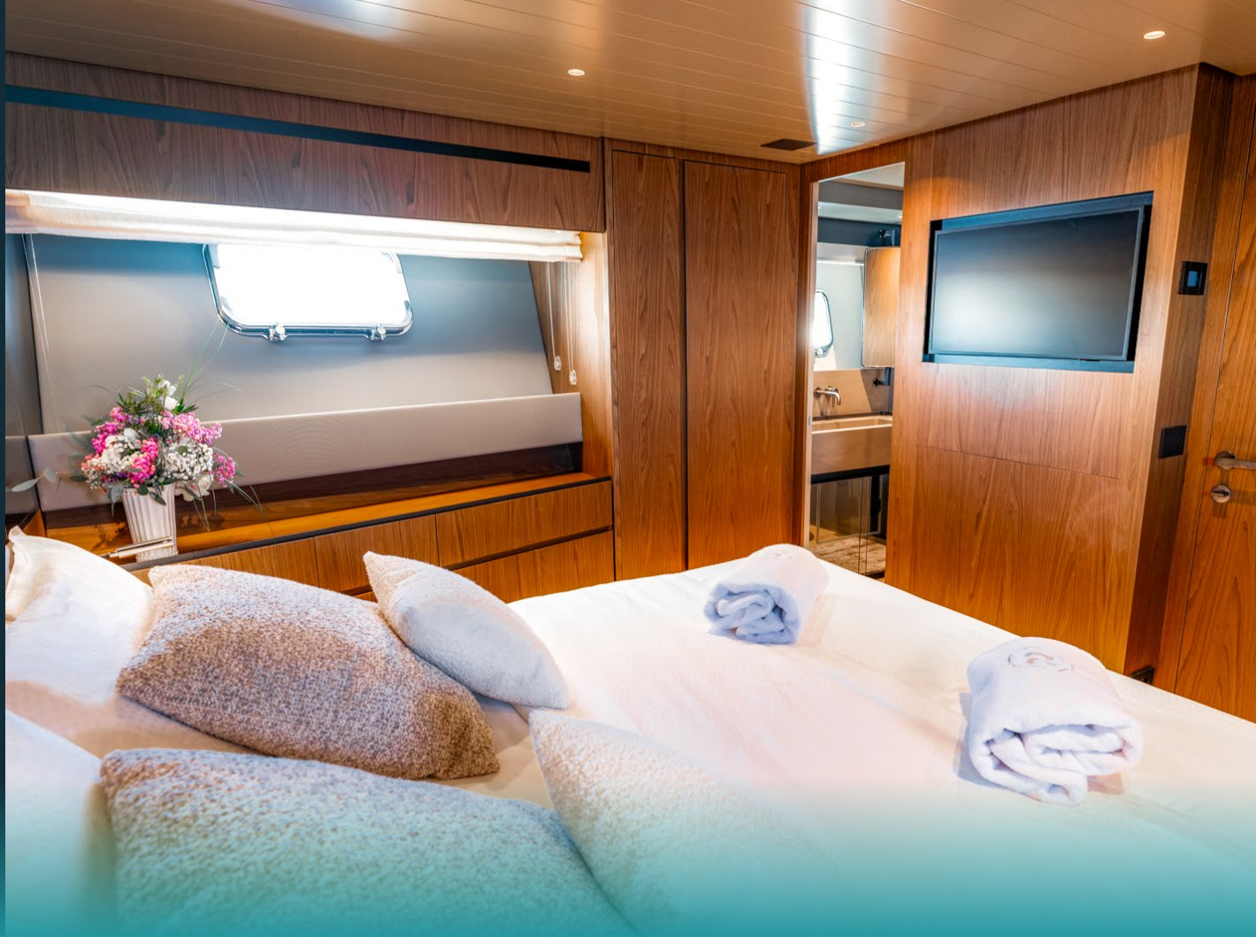
Double cabin side view