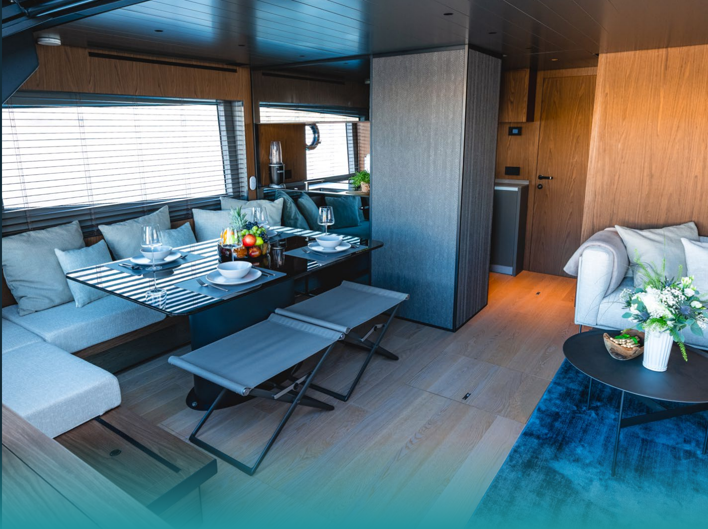
Salon and dining area view