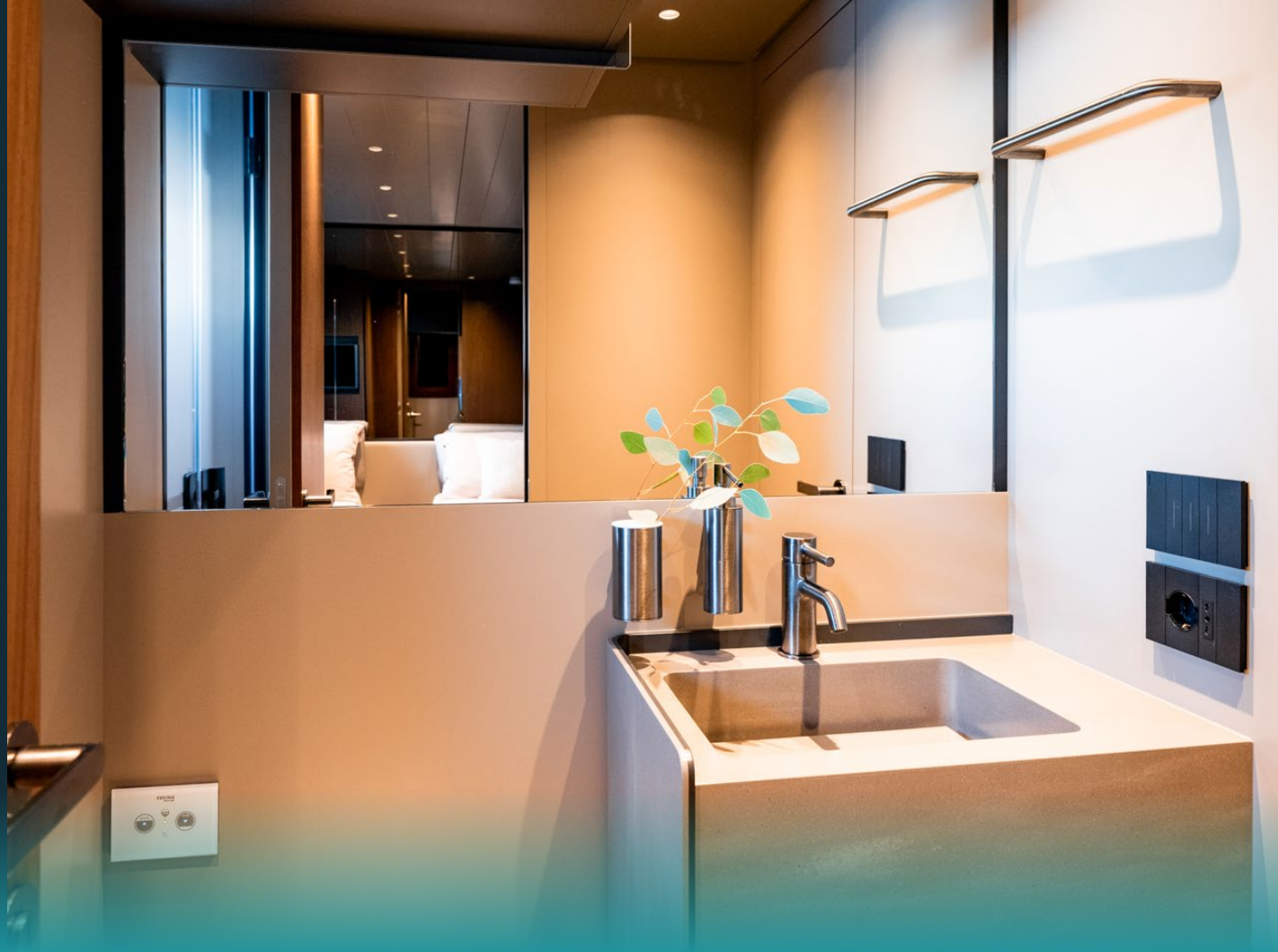
Twin cabin bathroom