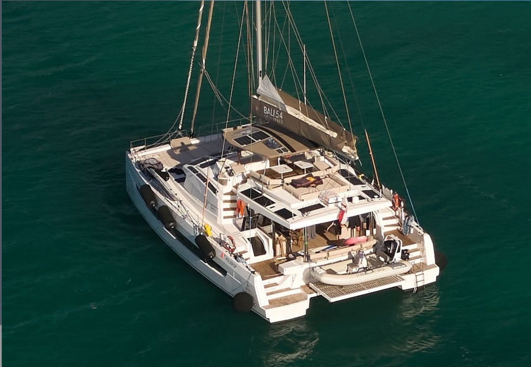
Sailing catamaran Bali 5.4 – Oceano