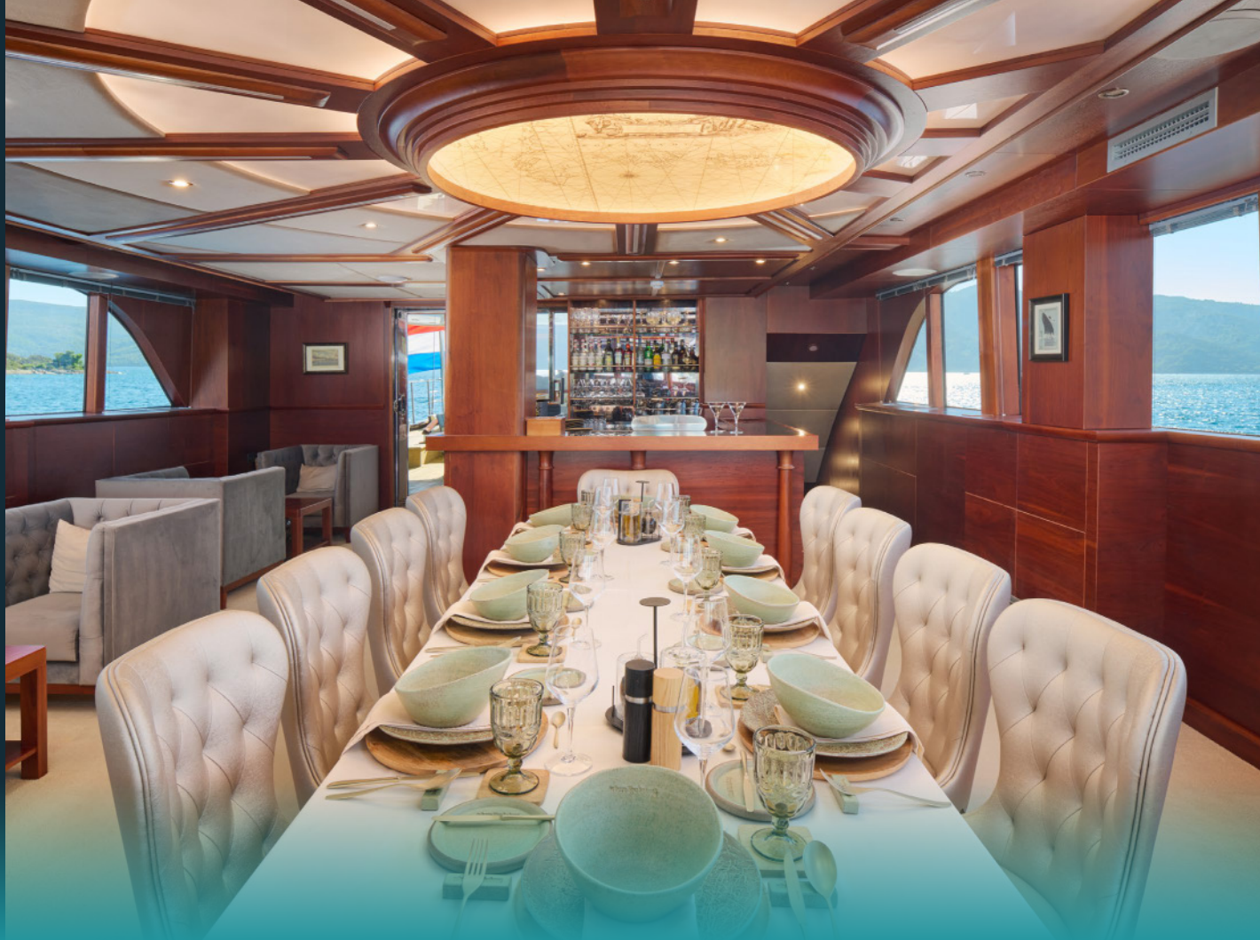
Salon Dining Table