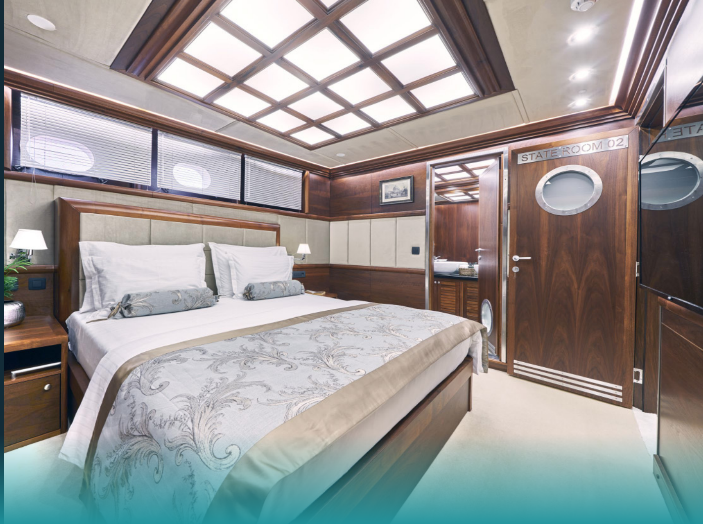
Double Cabin No2 and No3