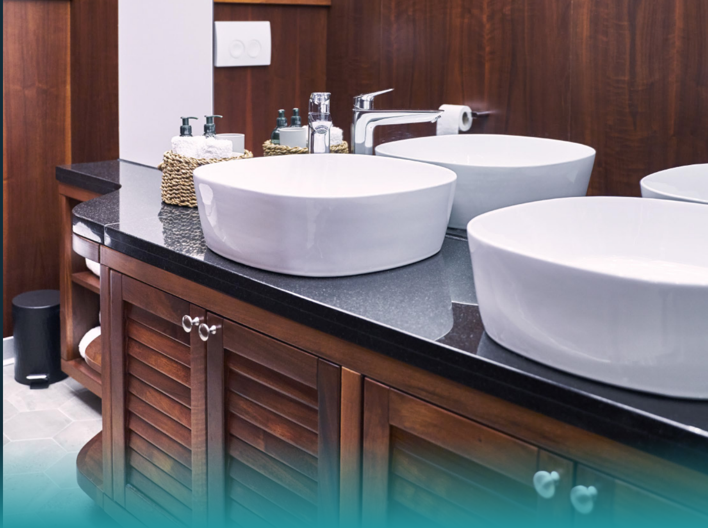
Lady Gita Bathroom