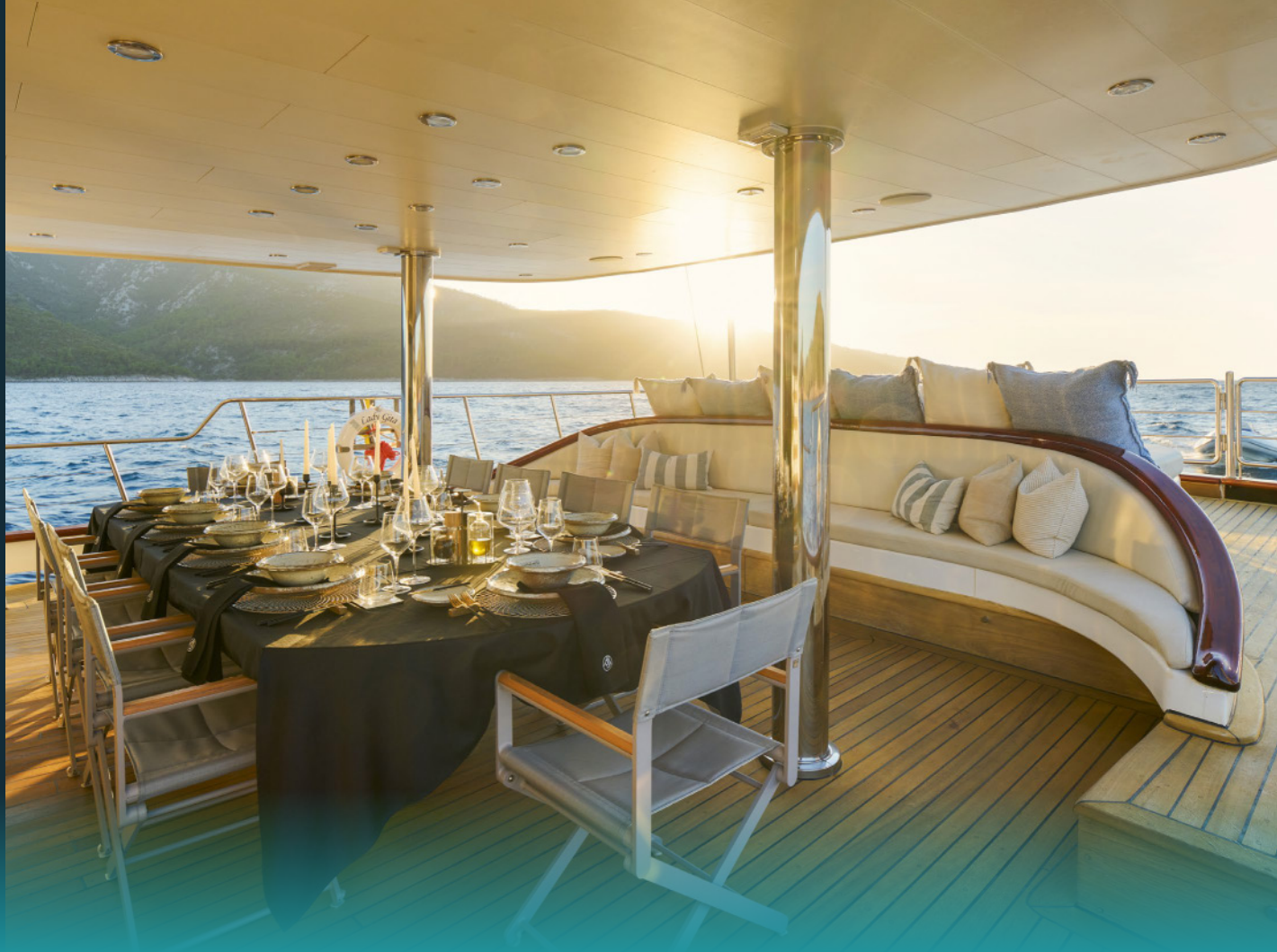
Aft Dining Table