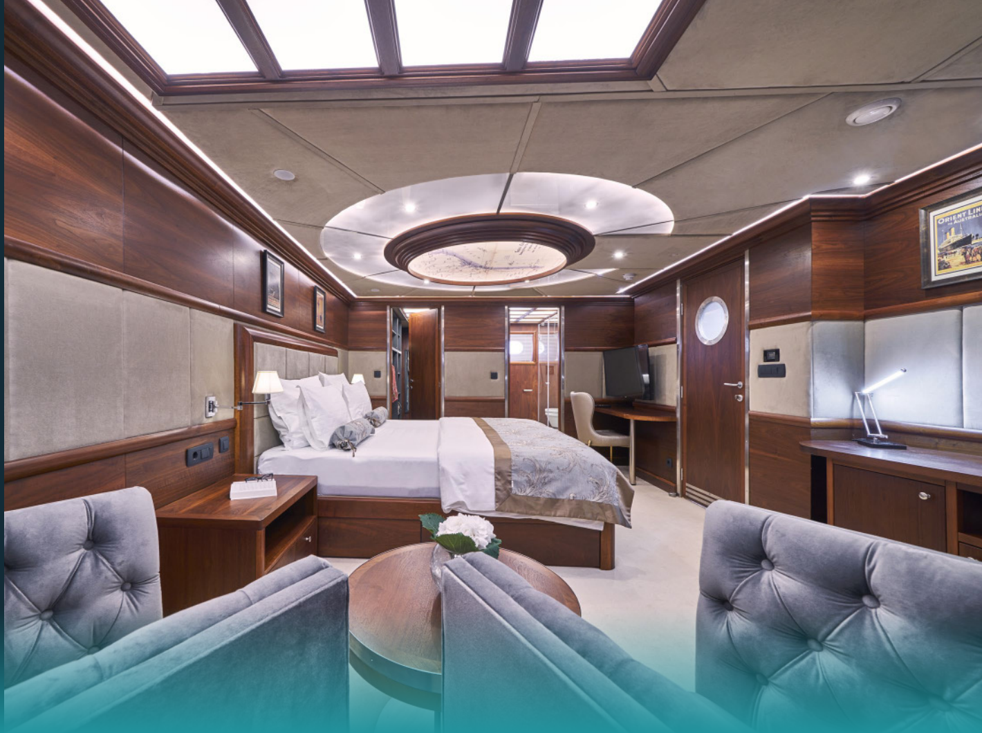
Master Cabin Aft Side View