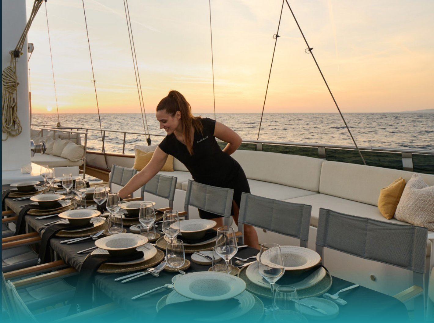
Sundeck Dining Table