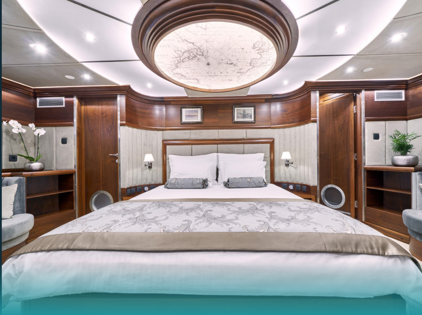
Master Cabin Bow