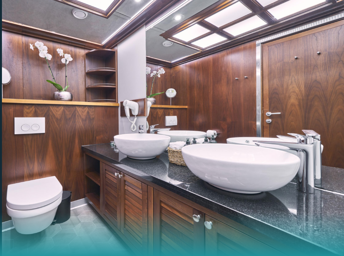
Cabin 2-3-4-5 Bathroom