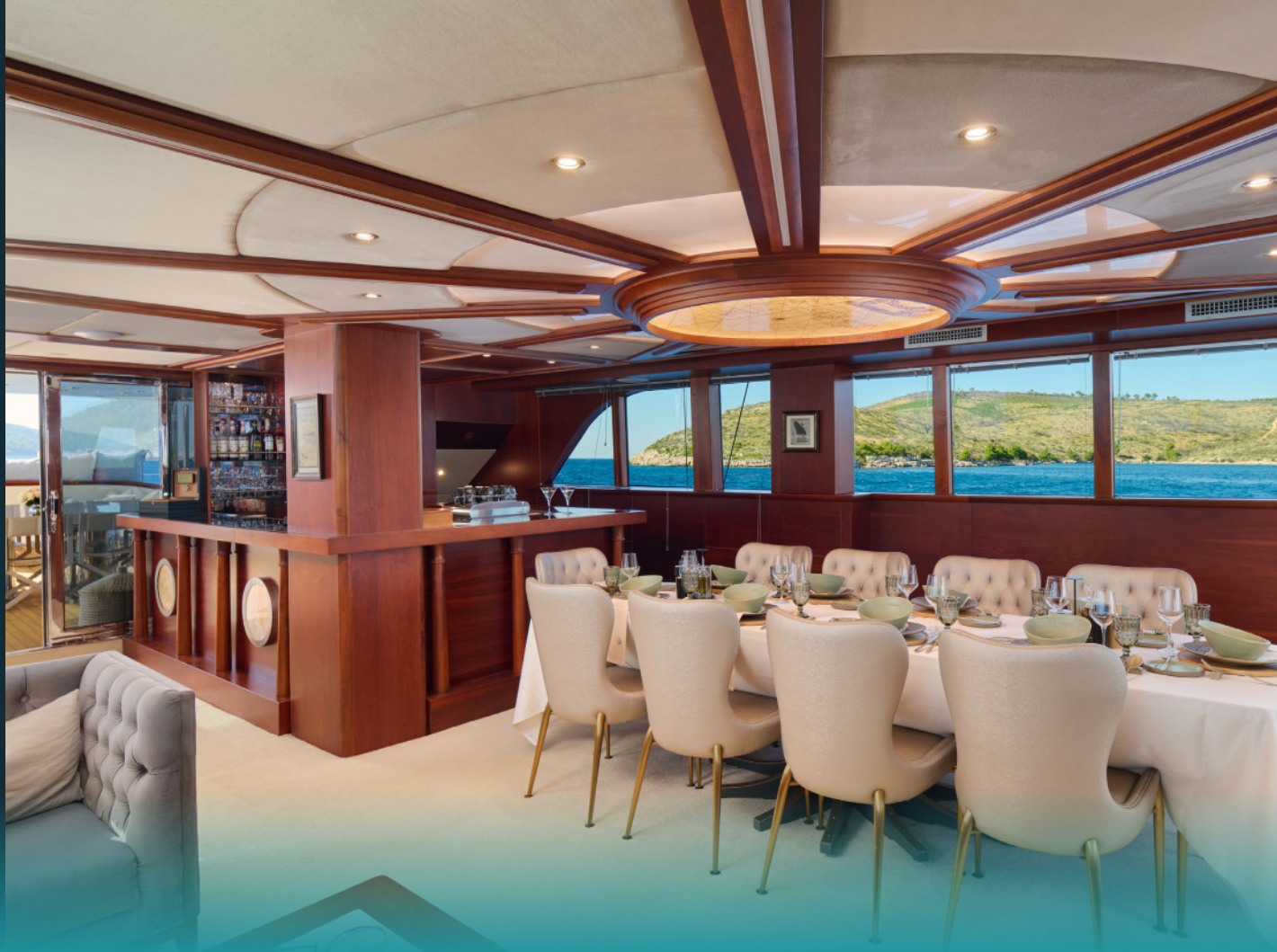
Salon with Bar