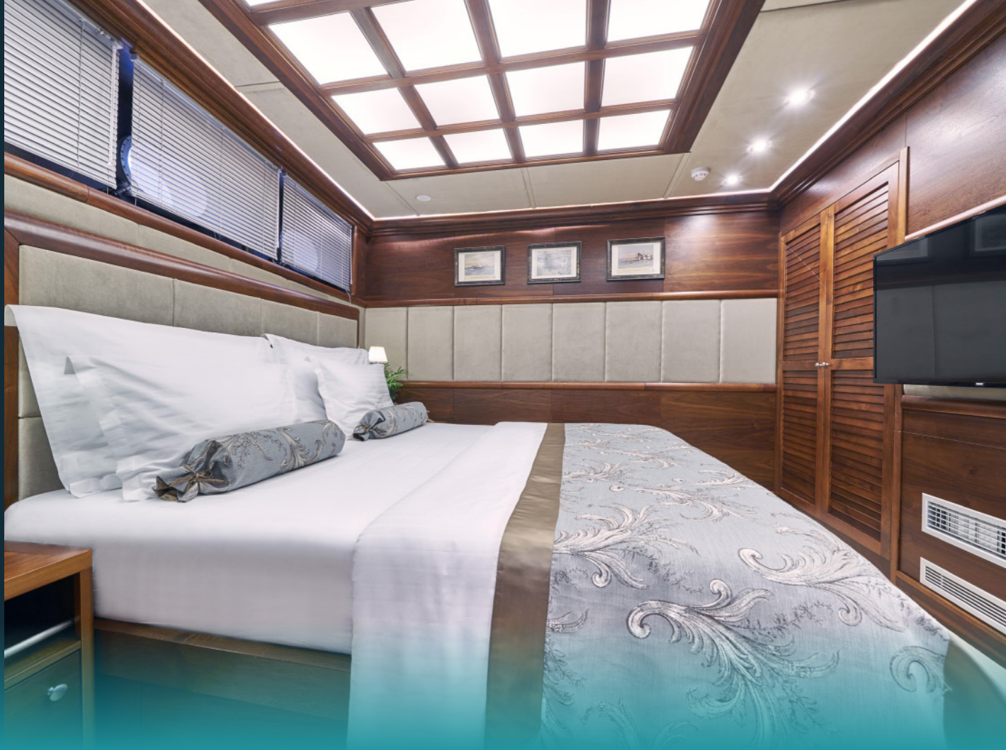
Double Cabin No2 and No3 Side View