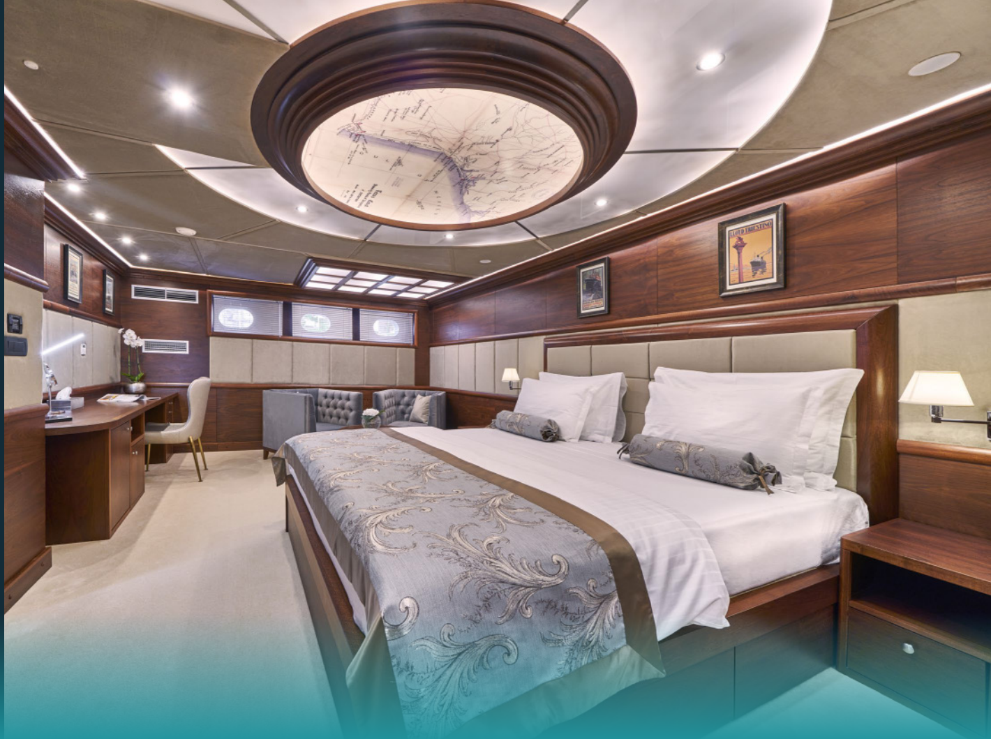
Master Cabin Aft